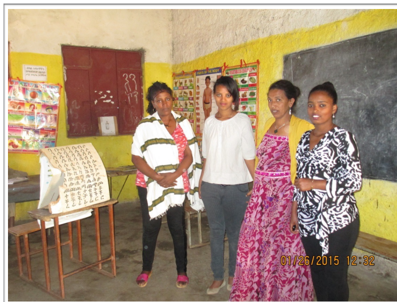
Classroom interior; 1st teacher, University of Gondar student, 2nd teacher, & university faculty member

Campus Representative 243-2839 peacecorps@umontana.edu