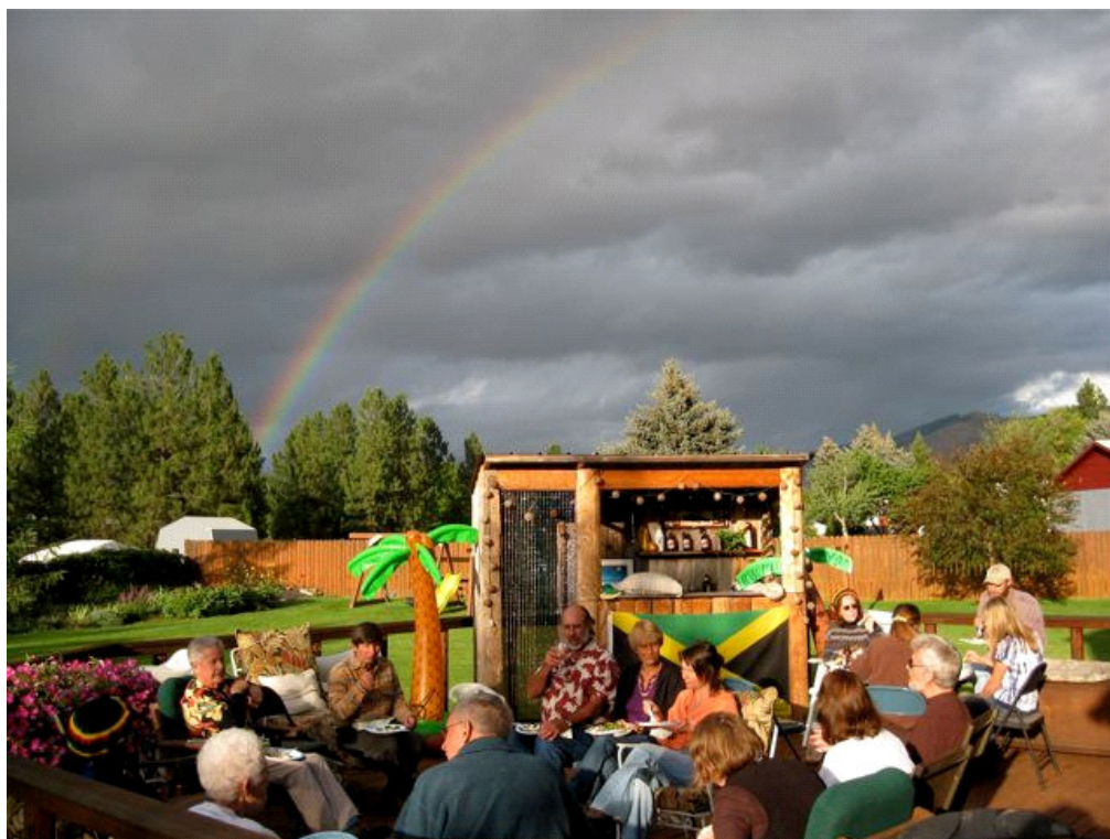
Jamaican Rum Bar under a Missoula Rainbow

JUNE 11, 112 & 13!!!! 2010!!!!!!!!!!!! Goat Chase Retreat Flathead Lake!!!!