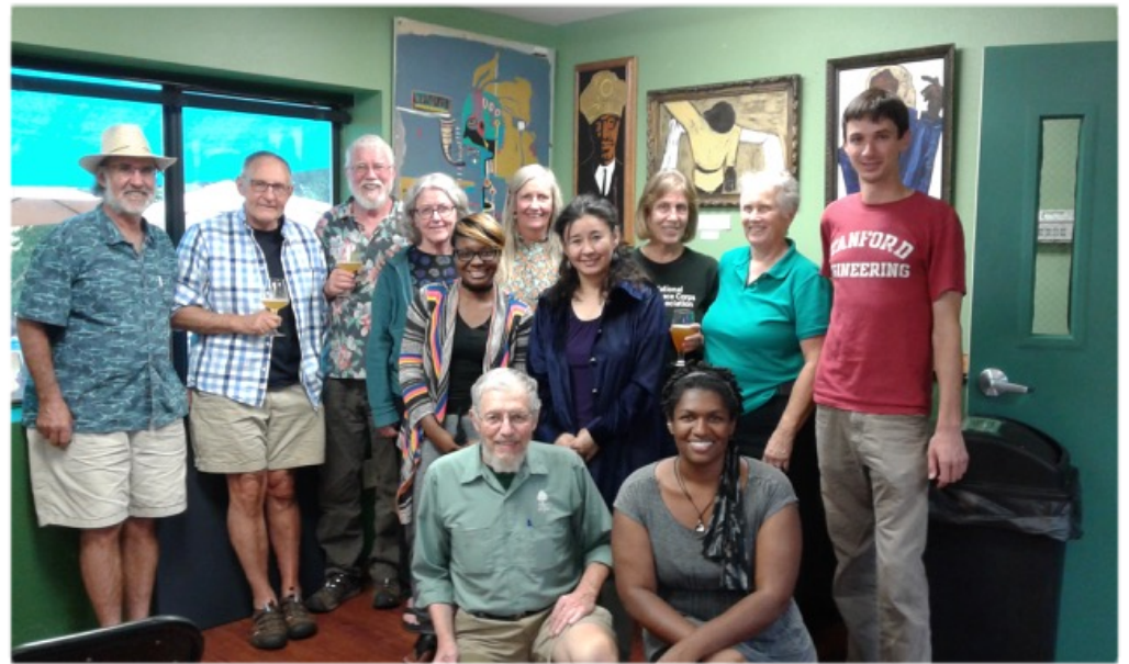
Meeting and greeting the new campus recruiter at the Imagine Nation Brewery

JUNE 8, 9, 10 2018 !!!!! THE GOAT CHASE ON FLATHEAD LAKE