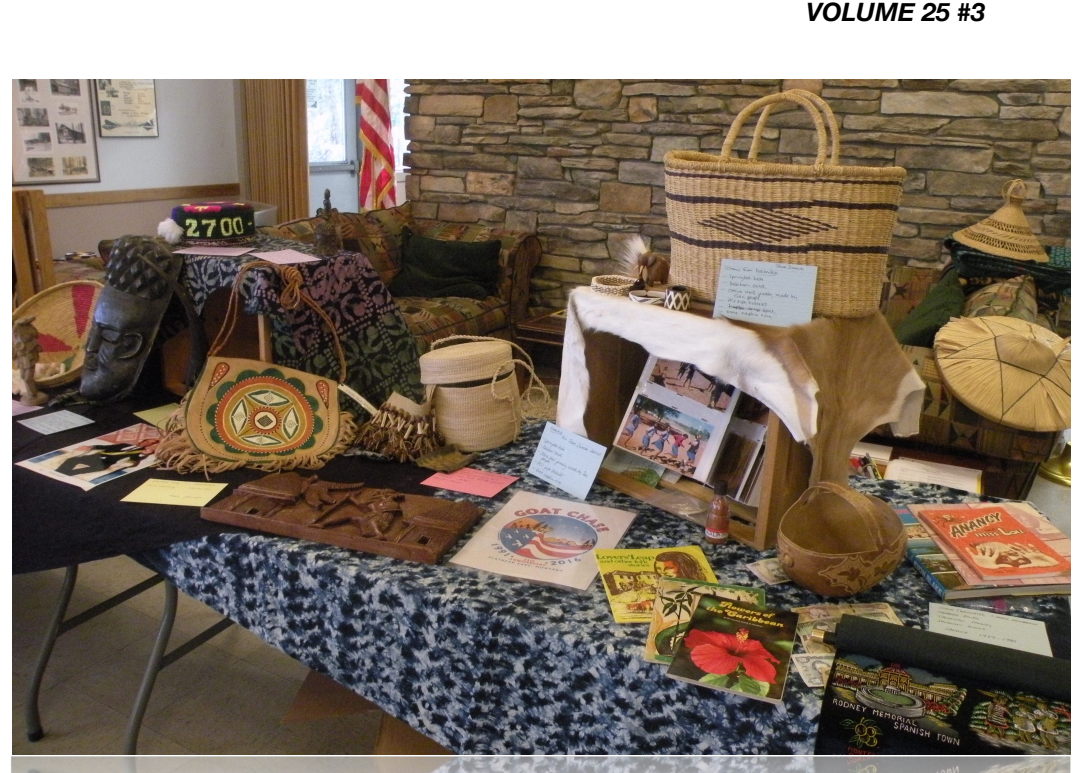
A collection of memorabilia from the 25th Annual Goat Chase

Inside this Issue: President's Message P1 New Members P2 P3 NPCA International Cal. P5 Membership P6