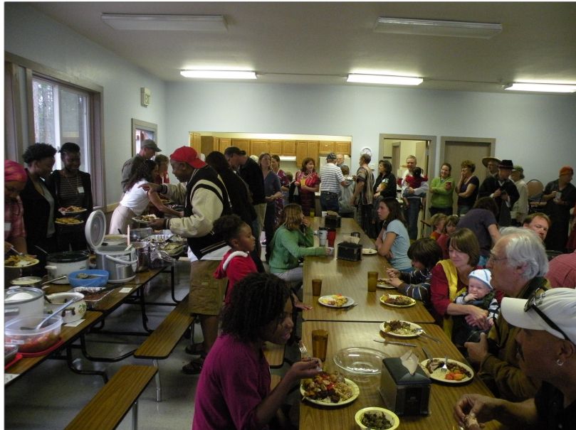
The Extravagant International Potluck