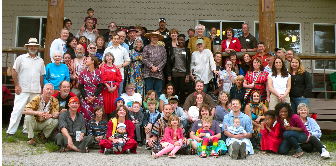
Happy campers at the 20th annual Goat Chase Retreat