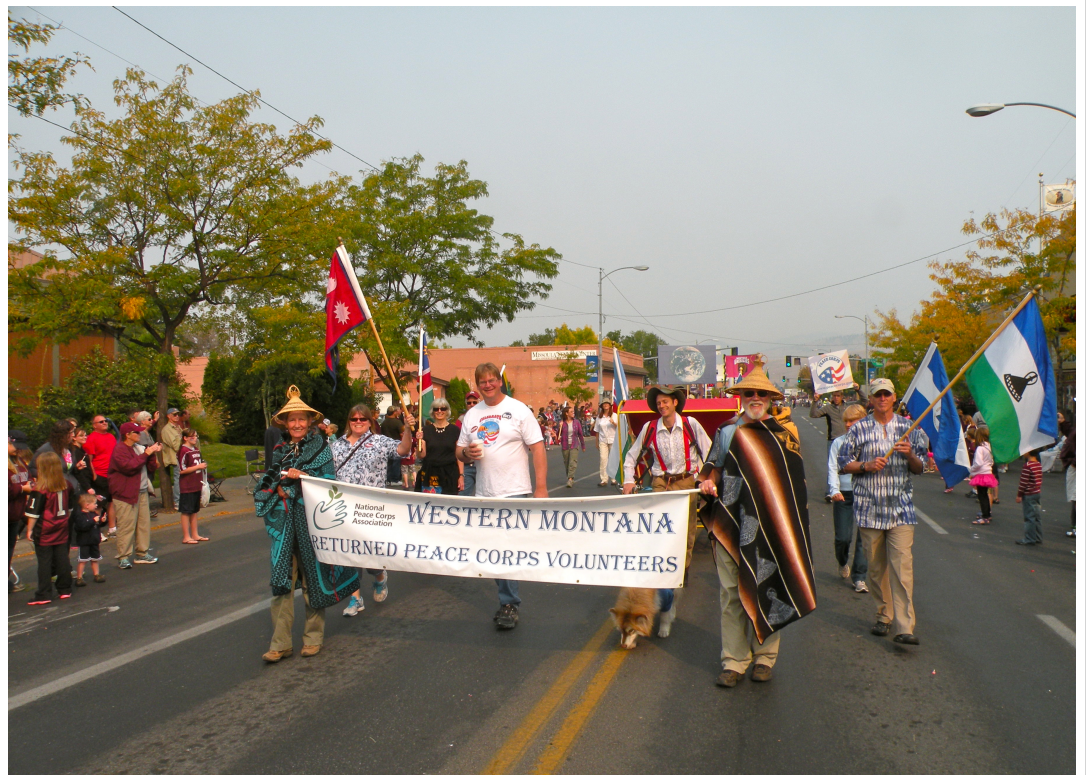
WMRPCV'S ENTRY IN THE U OF M HOMECOMING PARADE

JUNE 14, 15 & 16!!!! 2013!!!!!!!!!!!!!! Goat Chase Retreat Flathead Lake!!!!