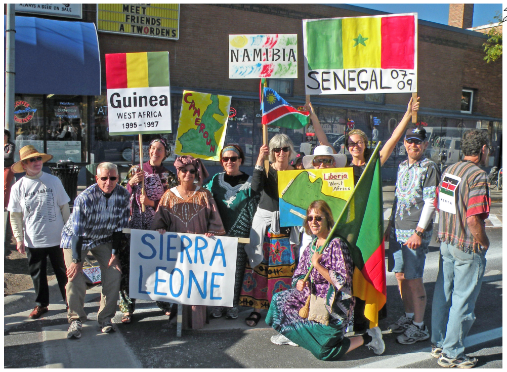
The African contingent