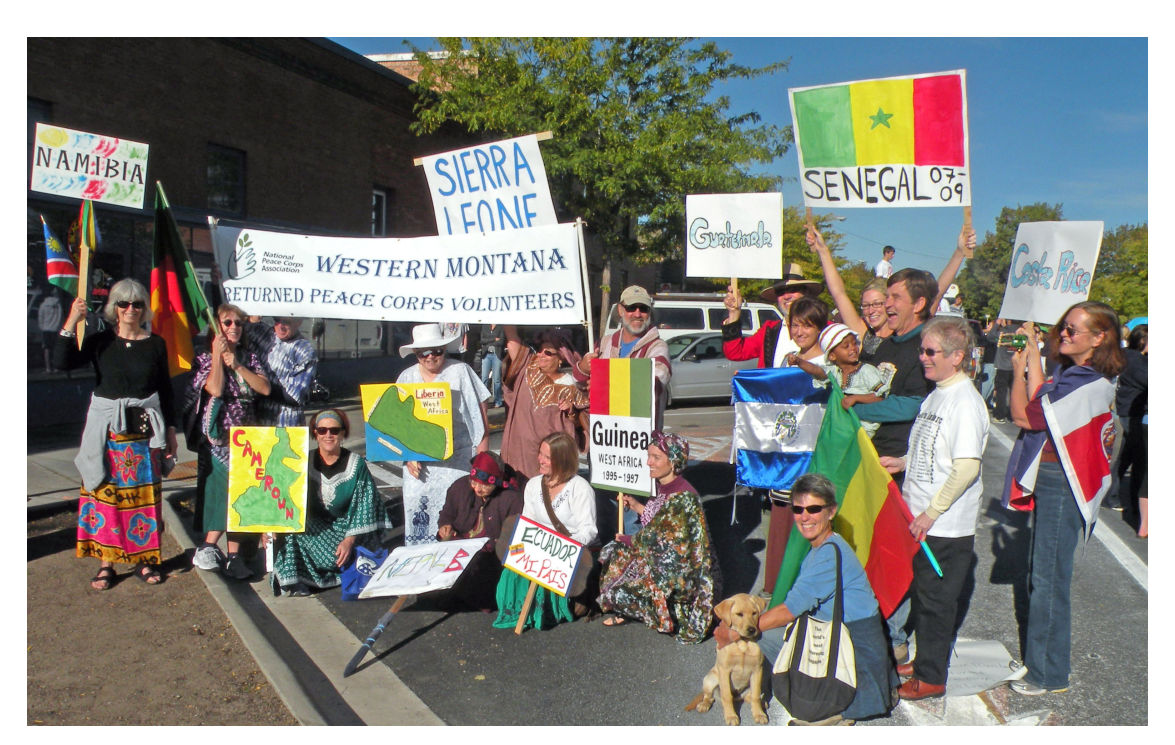
The Western Montana RPCVs in the University of Montana Homecoming parade