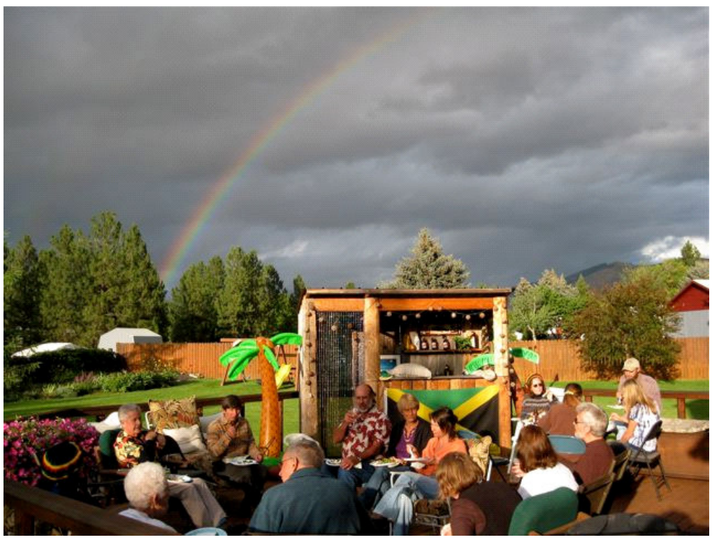
Jamaican Rum Bar under a Missoula Rainbow