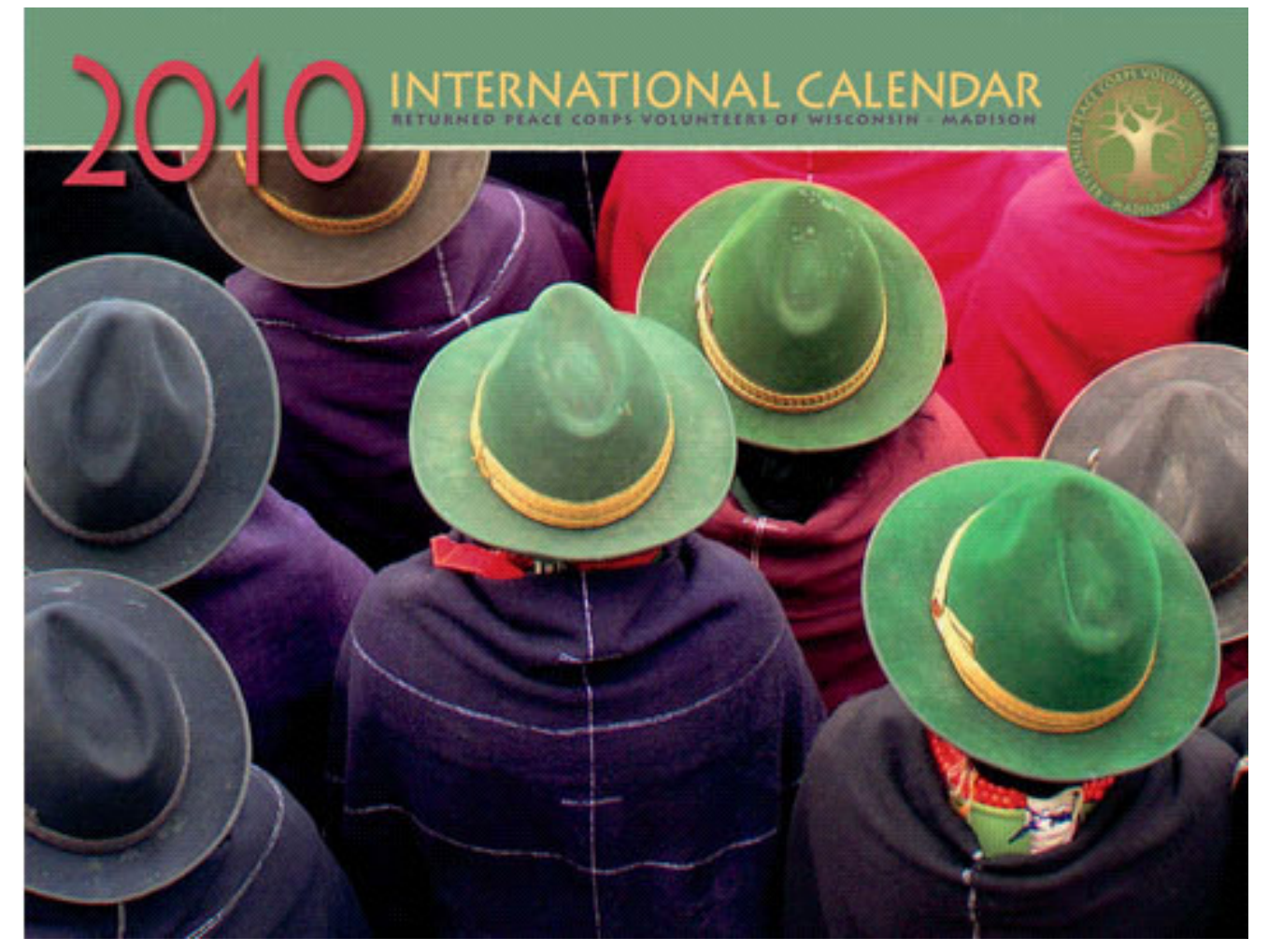
Western Montana Returned Peace Corps Volunteers Help plant the seeds for peace 365 days a year...

The funds raised from the sale of the International Calendars developed by the Madison, Wisconsin RPCV group are directly donated to a variety of local and International humanitarian endeavors. If you have a project you would like considered, please contact us at wmrpcv.com.