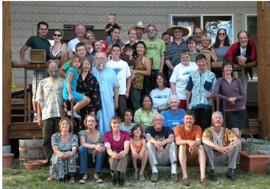
Goat Chase Retreat attendees 2009

JUNE 11, 112 & 13!!!! 2010!!!!!!!!!!!!!! Goat Chase Retreat Flathead Lake!!!!