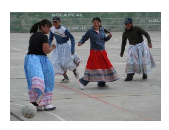
"Yus pagará sunqi" ("God will repay your heart" in quechua

themselves also participated, along with local Peace Corps volunteers and others, in an entertaining and successful fundraiser for the project, which we called Pelotas y Polleras, or Soccer in Skirts — a tournament where all the players (men and women) wore the local traditional skirts (polleras).