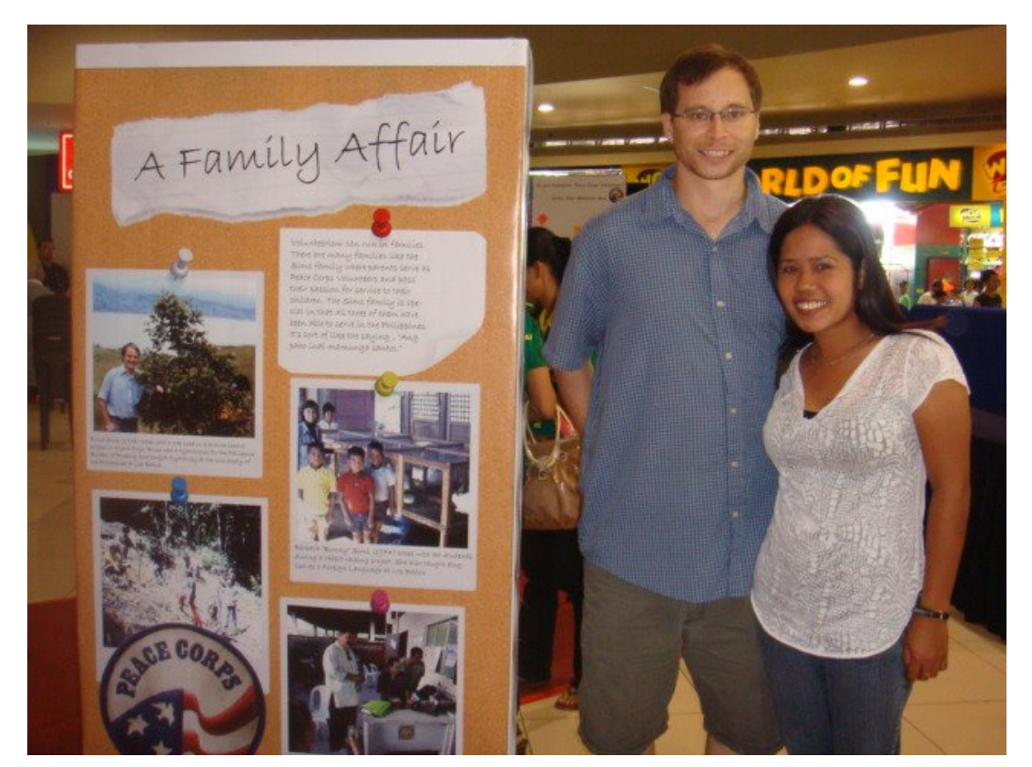
Celebrating 50 years of Peace Corps by honoring the Sims family connection in the Philippines.