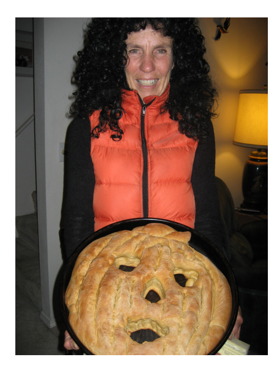
Jeannie with a jack-o-lantern bread